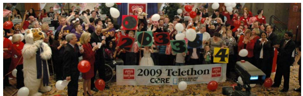
Families, staff and volunteers celebrate the final total at the 2009 Easter Seals Telethon.

Many Telethon VIP Campaign special events were highlighted throughout the evening. Here are just a few of the