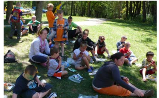
Campers having lunch in the shade at Timber Pointe Outdoor Center.

the summer ahead. We still have openings in all of our scheduled camp weeks but our spots are filling up quickly. All the information you need for camp is on the website at www.ci.easterseals.com .