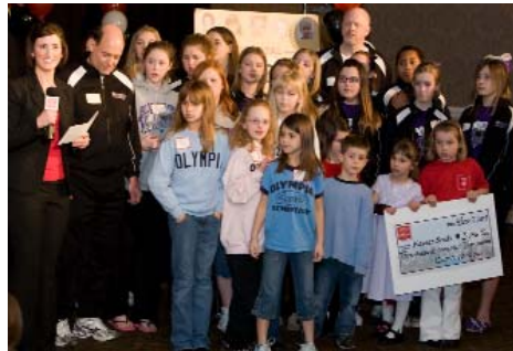
Bloomington Junior High School Volleyball Team presents a check on the Telethon for their event.

Through the generosity of donors in central Illinois, the 2009 Easter Seals Telethon went off the air with $2,003,384 in donations. The five hour show, broadcast live on WMBD 31, showcased hundreds of volunteers, who committed to raising $500 prior to the Telethon, answering phones in both Peoria and Bloomington-Normal.