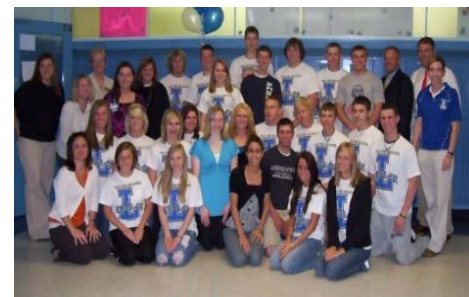
The Limestone Community High School Student Council.

Congratulations! This is a much deserved award!