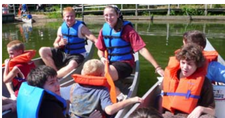
A group of counselors and campers gearing up for a boat ride around Lake Bloomington.

As the summer season begins I recall my first summer as a camp counselor 30 years ago. Like many who work as counselors for the first time, I was excited and terrified at the same time in thinking about the arrival of my campers; excited as I had heard many amazing stories about the extraordinary people that I would be working with at camp and could not wait to meet; terrified as I knew that these campers with special needs were going to require much more of me than I had ever given in order to make sure they had a great time and were properly taken care of in a fun and safe environment.