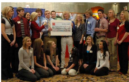
The students at Limestone High School present their check for $33,000 at the Easter Seals Telethon.

Congratulations to the Easter Seals Auxiliary for raising $45,000 at their annual fashion show in March to benefit the children and families served by Easter Seals in central Illinois. Also thanks to Bergner's Grand Prairie for providing all the fashions for the event.