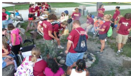
Everyone gathers around the bonfire after a day at camp.

As you plan for your child to go to camp this summer, please know that we take very seriously our responsibility to make sure that your camper not only has a great time at camp with plenty of learning